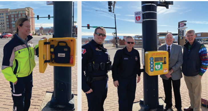
Johnson County's first public AED